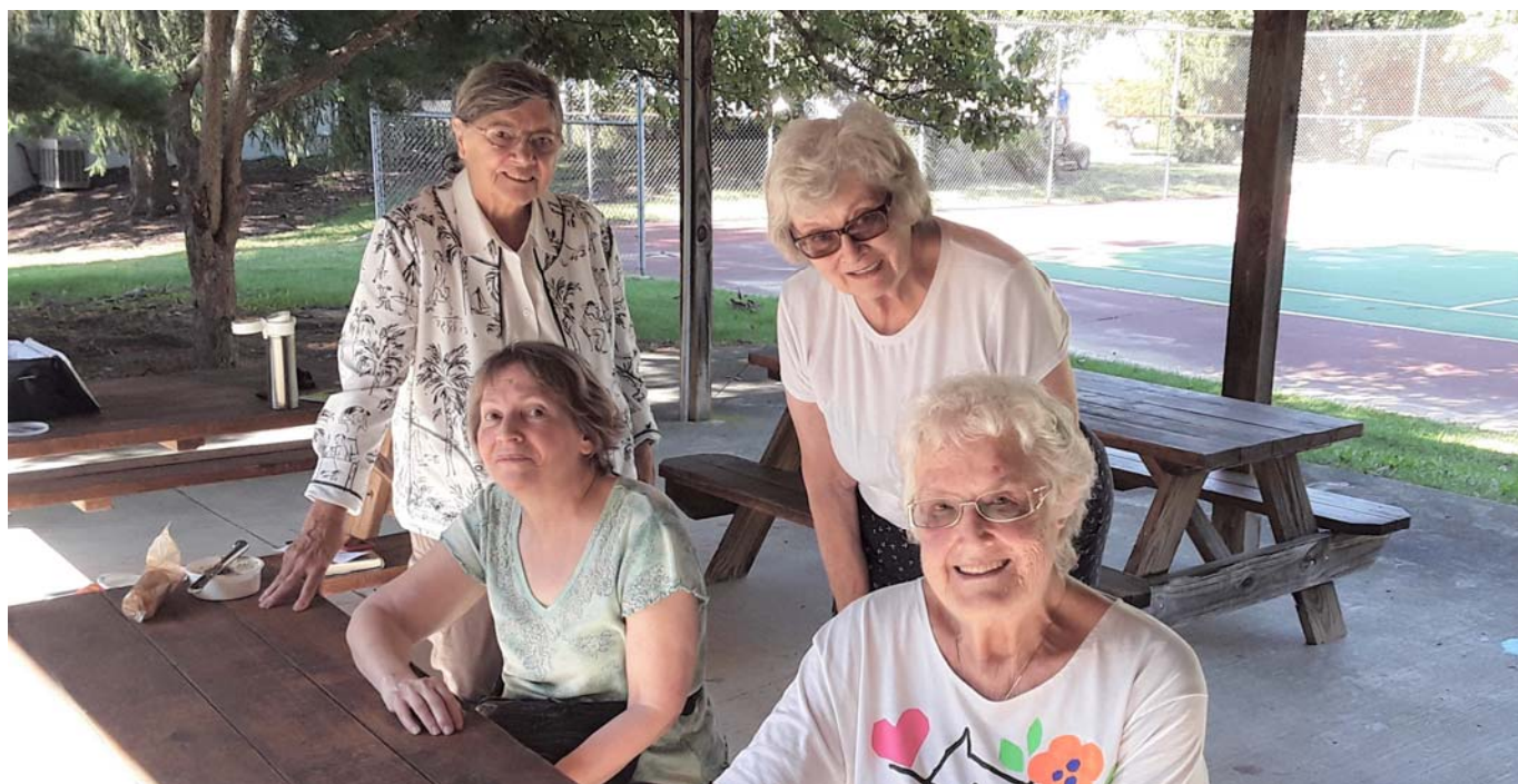
September 29th at Peppergrass shelter discussing "Priceless - How I went undercover to Rescue the World's Stolen Treasures"