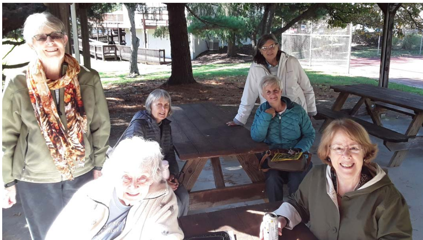
October 27th at Peppergrass shelter selecting 11 books of 21 for our 2022 reading list.