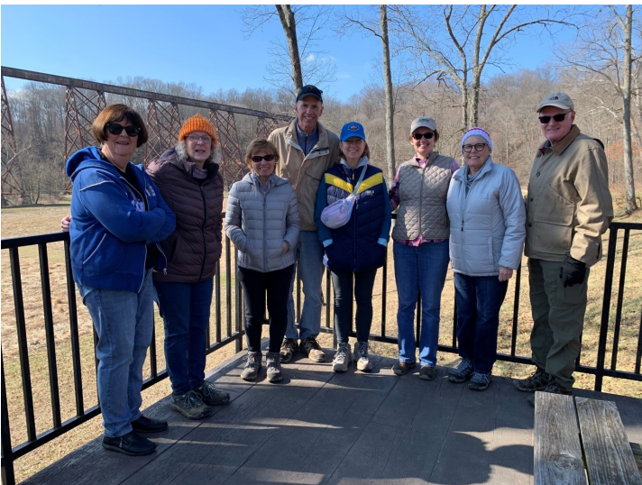
Tulip Trestle Viewing Platform, Solsberry, Indiana.