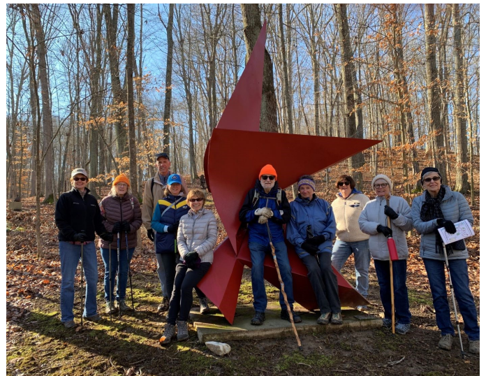
Greene County Sculpture Park, Solsberry, Indiana