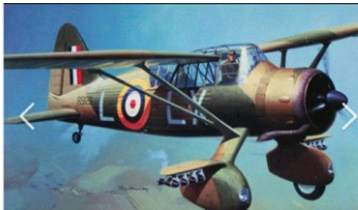
Lysander II used for SOE night missions to French resistance.